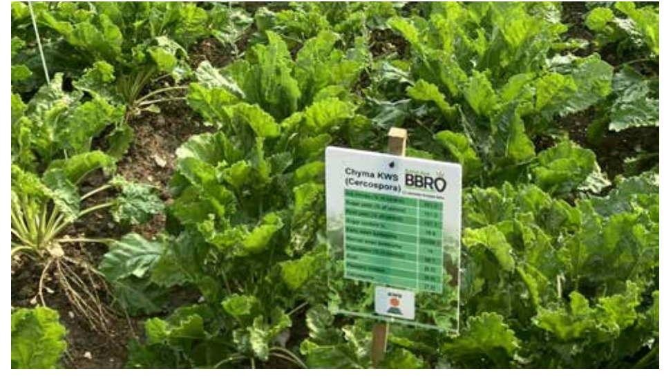
The 2025 sugar beet Recommended List includes the first cercospora-tolerant variety, Chyma KWS, which incorporates CR+ genetics.

Before varieties can be sold or considered for the RL, the Animal and Plant Health Agency (APHA) assesses