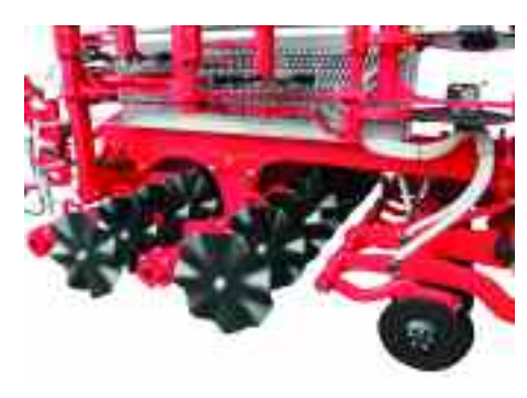
Pottinger's wave disc has a wavy profile, which is angled in the direction of travel.

Amazone offers a 80mm-wide tine, which is particularly suited to intensive loosening at working depths of 12-30cm. A 100mm wide share tip is available, suitable for 10-20cm